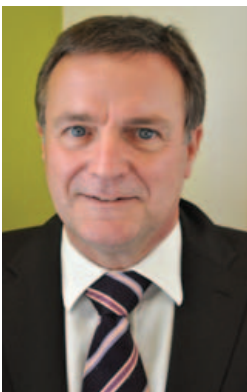
Chris Morecroft President, Association of Colleges

This document supports the formal launch of the project, and gives a snapshot of the current position with respect to social inclusion and what the project intends to do. The project can be followed through http://www.aoc.co.uk/en/aoc-create/aoc-create-projects/index.cfm . We are very excited by the programme of activity, the launch, forthcoming seminars and hope that you are too.